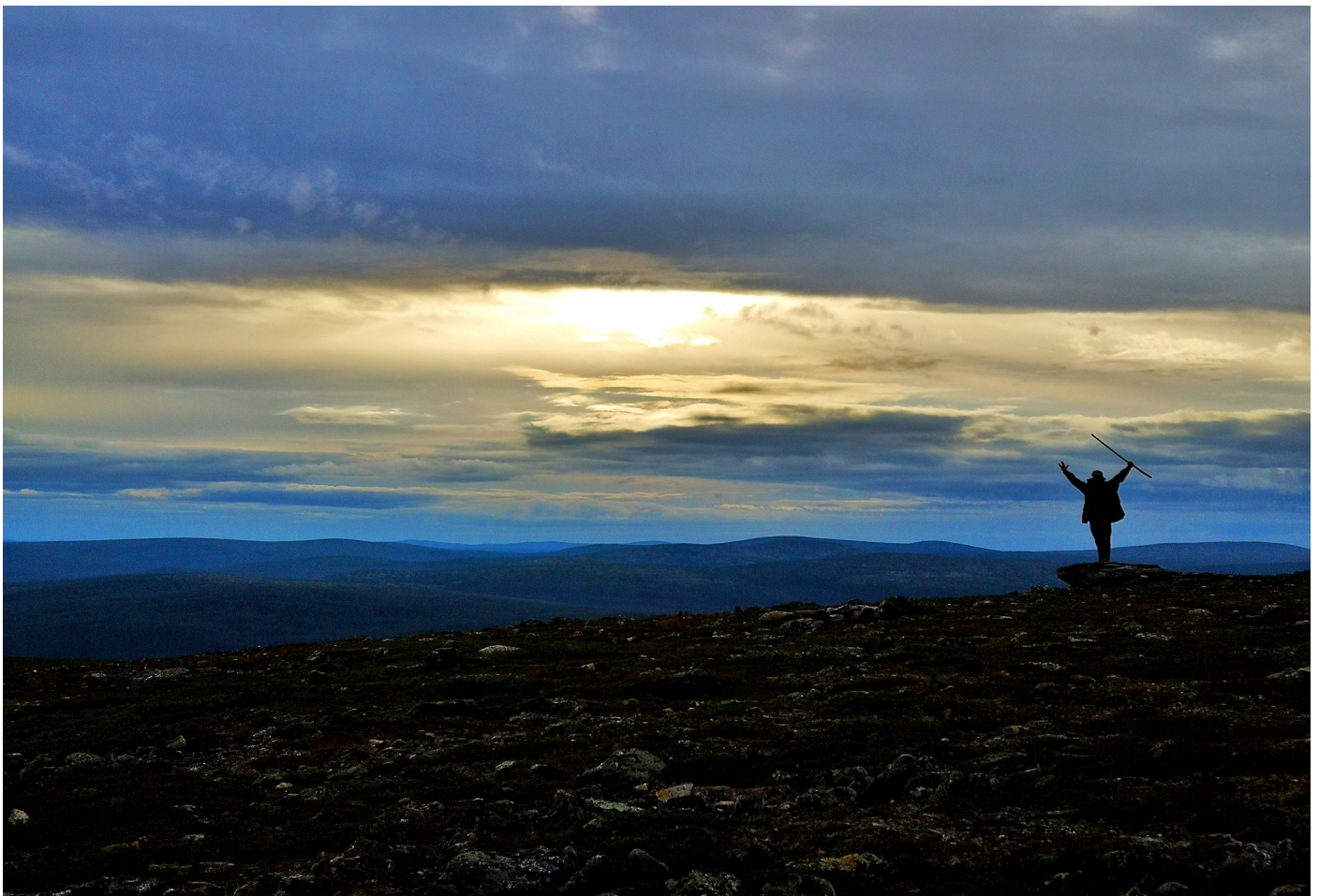
At the top of Mount Morganmaras in Lemmenjoki, Lapland.

It is like this when we meet Him for the first time, and it is the same, sometimes even more powerful, when we see His face when we haven’t seen it for some time—after He as though hid His face from us; after we felt lost and abandoned – like the disciples on the Emmaus road. When we have an encounter with God, He is retelling us our story, and the