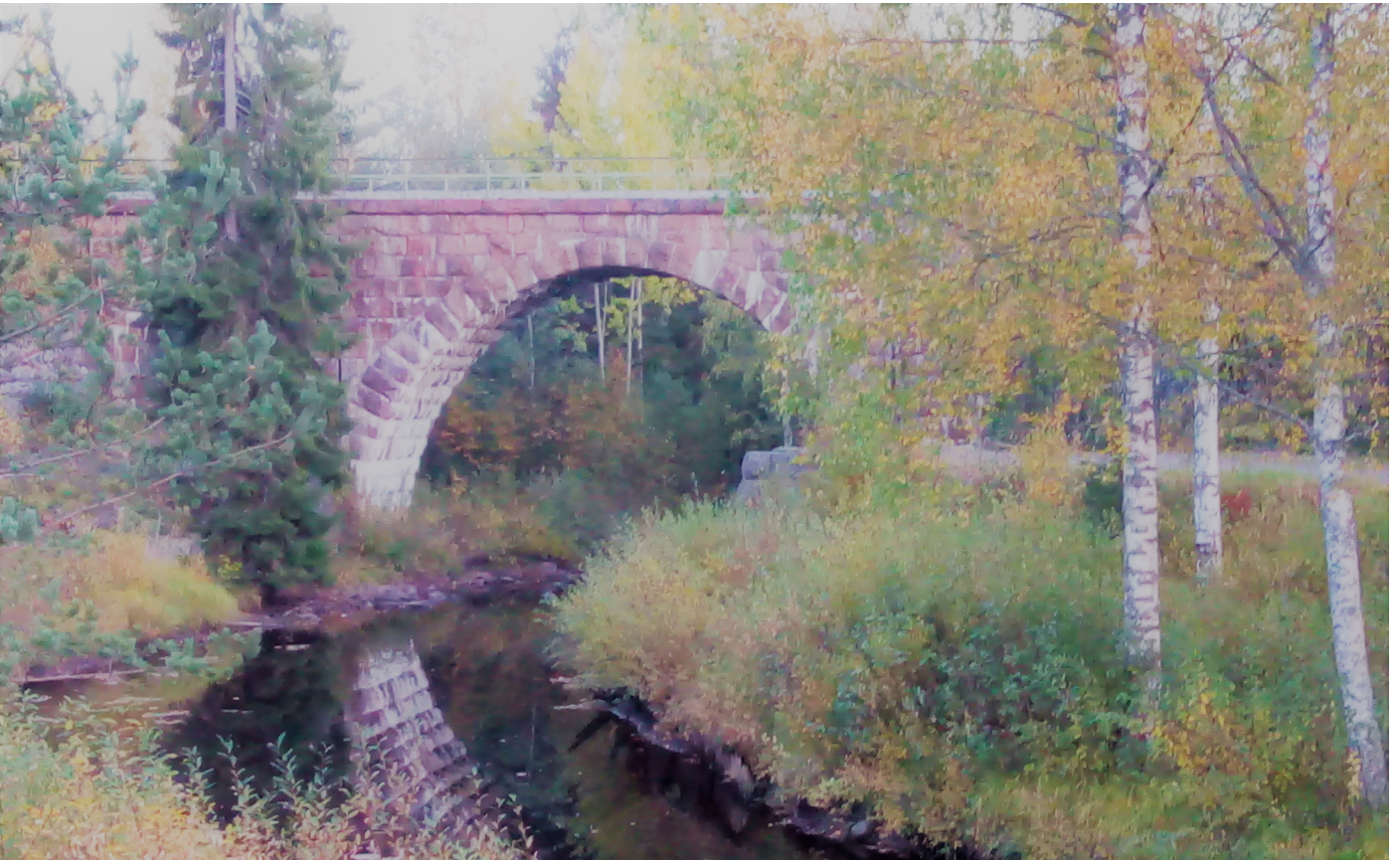
An old railway bridge in Central Finland.

most important part of this re-told story is Him, Himself. Despite all we may have thought and felt, in this new story we are not alone – He is and has always been with us!