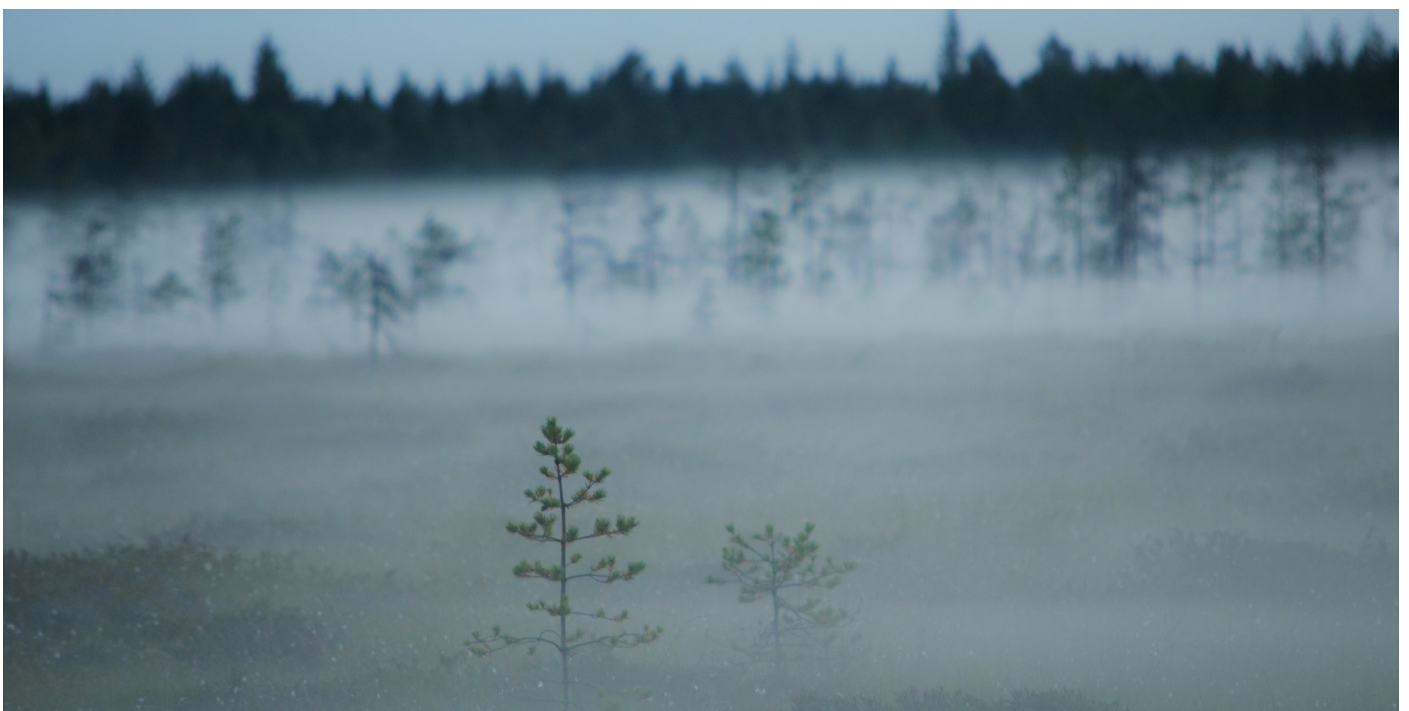
Stillness of a swamp in the midst of mist in Northern Finland.

- The Day of the Lord will be the day of wrath (from which the church will be rescued; (1 Thes. 1:10; 5:9).