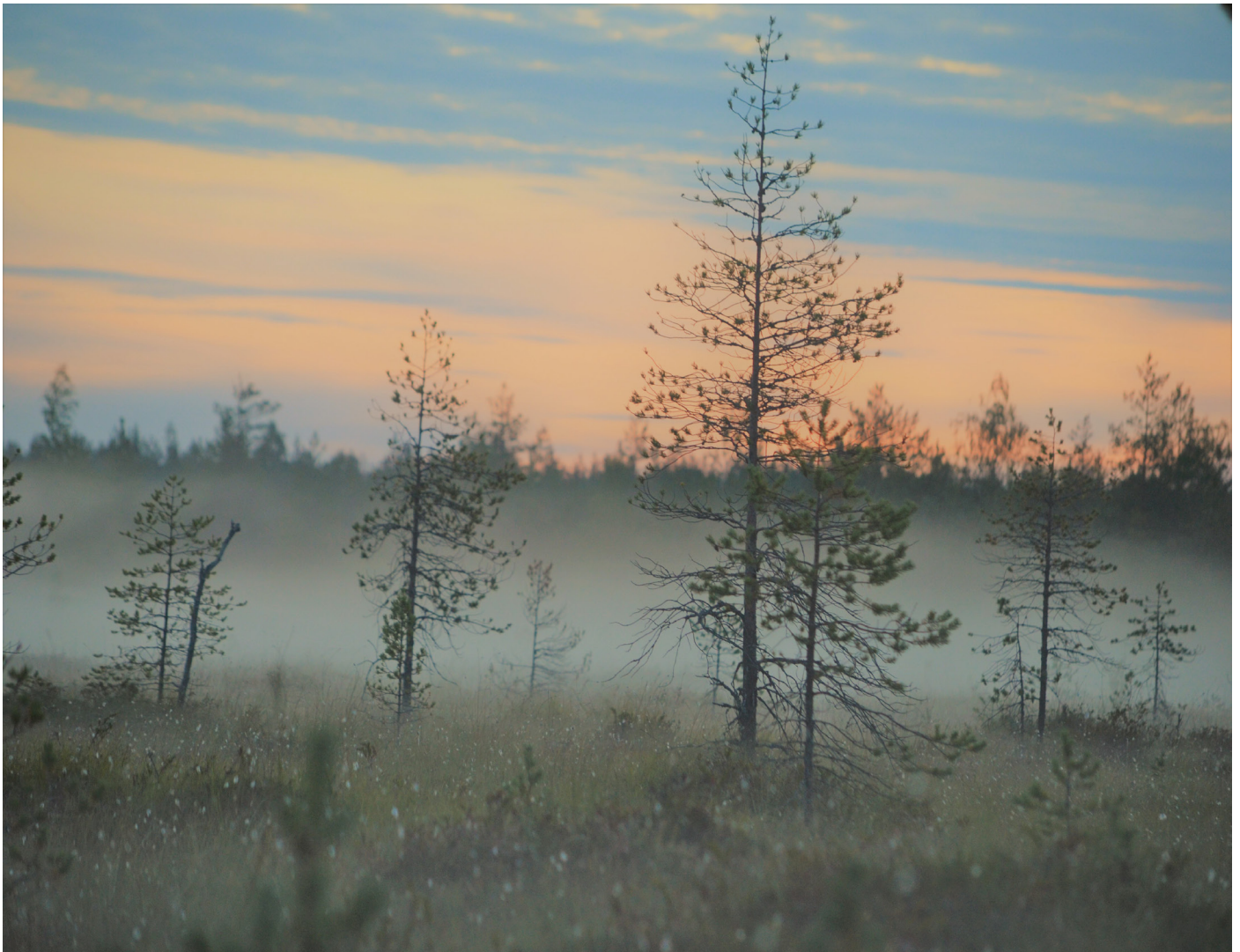
Stillness of a swamp in the midst of mist in Northern Finland.