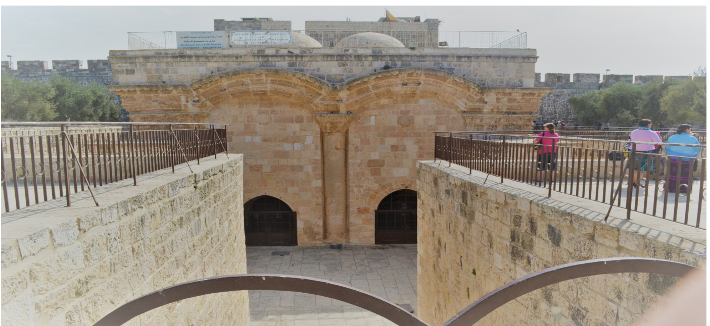
The Messiah Gate on the inside of the Temple Mount in Jerusalem.

God gave his Word in the form of the Hebrew Scriptures to confirm this divine truth, and he gave it to the Jewish people as a sacred trust so that they could be stewards of his mysteries and could convey that understanding to the rest of the world. Christian fruit: Jewish root!