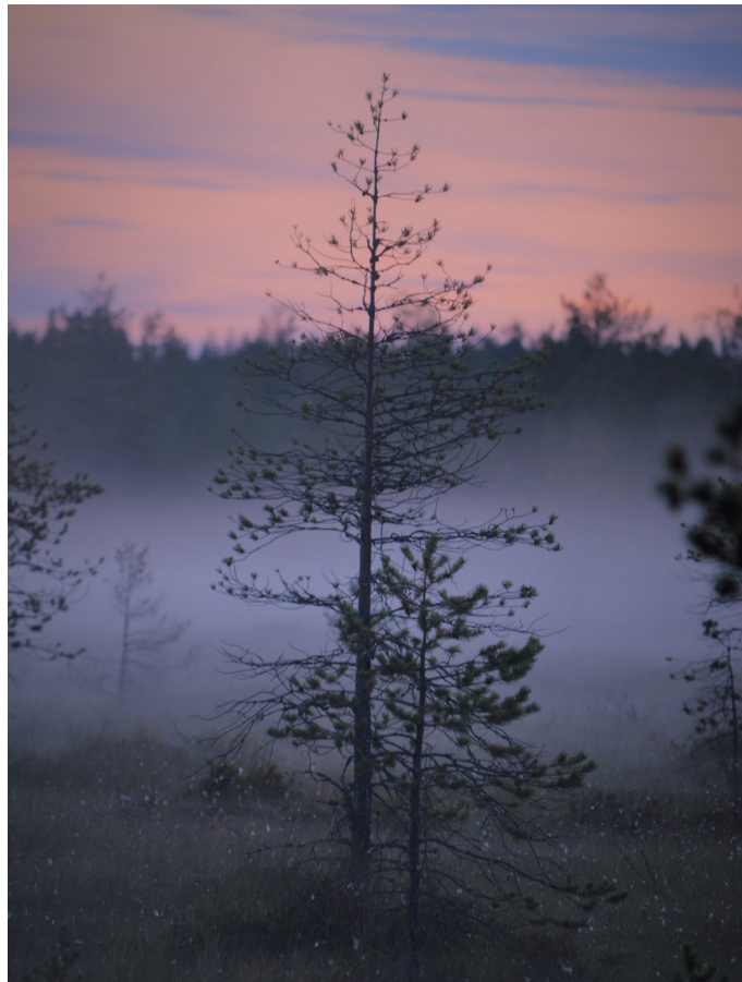
Stillness of a swamp in the midst of mist in Northern Finland.