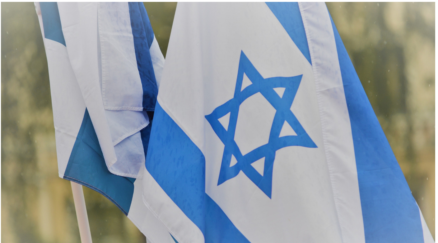
Finnish and Israeli flags were waving together at the March of Life in Tampere, Finland in August 2019.