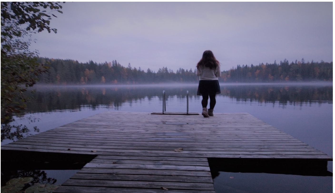
A moment in prayer by the lake in Finland.

"Go, my people, enter your rooms and shut the doors behind you, hide yourselves for a little while until his wrath has passed by. See, the Lord is coming out of his dwelling to punish the people of the earth for their sins. The earth will disclose the blood shed upon