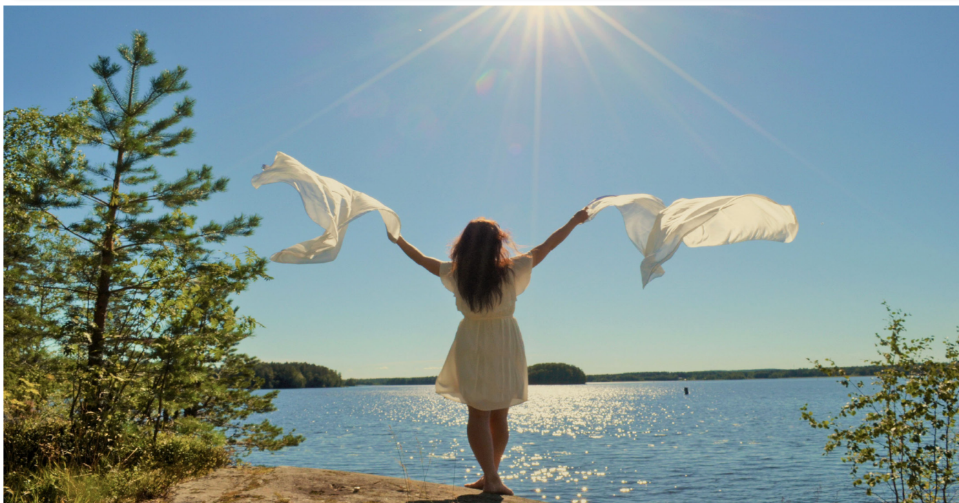
A moment of worshipping the God of Israel by the lake in Finland.