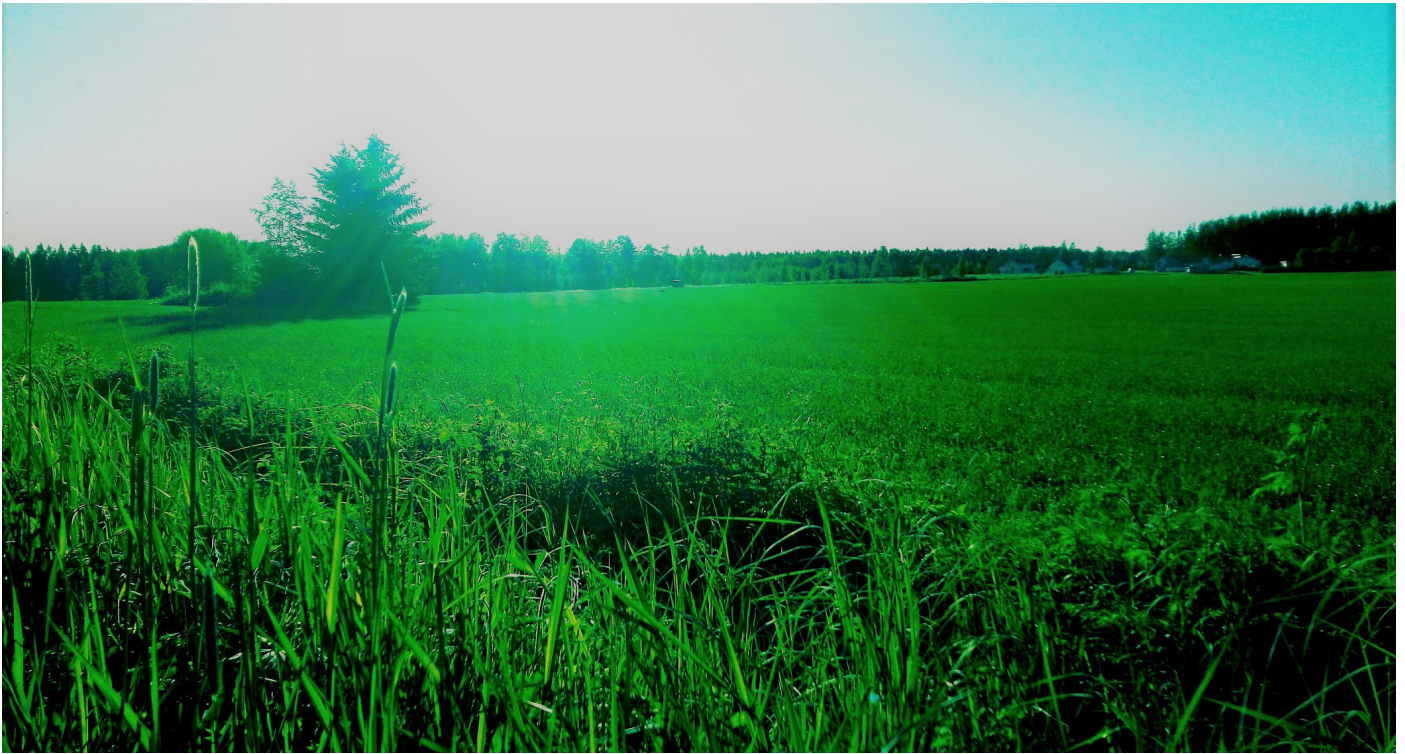
The harvest is ripe for reaping.