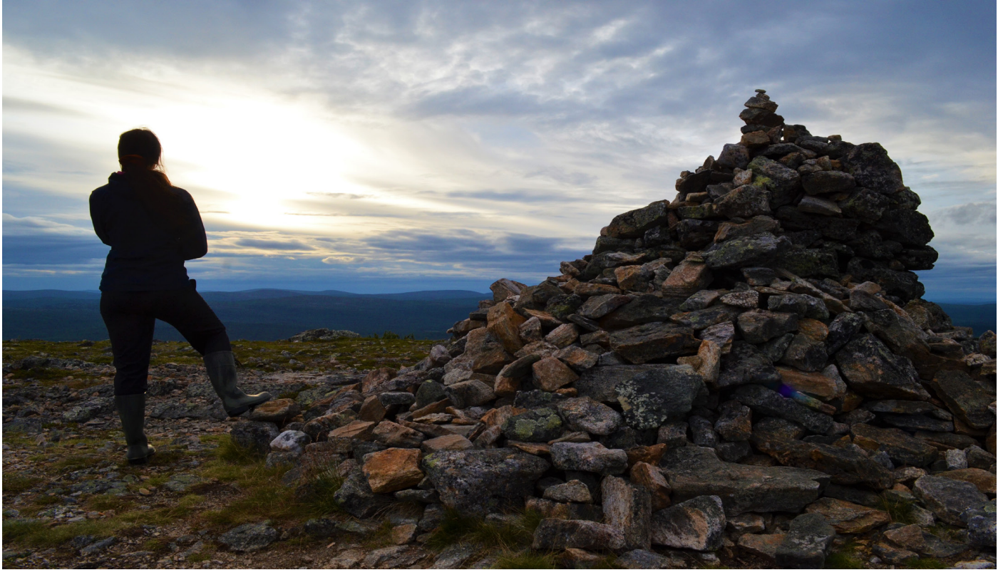
At the top of Mount Morganmaras in Lemmenjoki, Lapland.